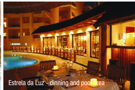
Estrela da Luz - dinning and pool area