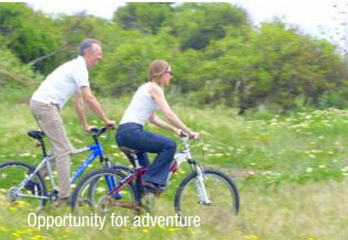
Opportunity for adventure