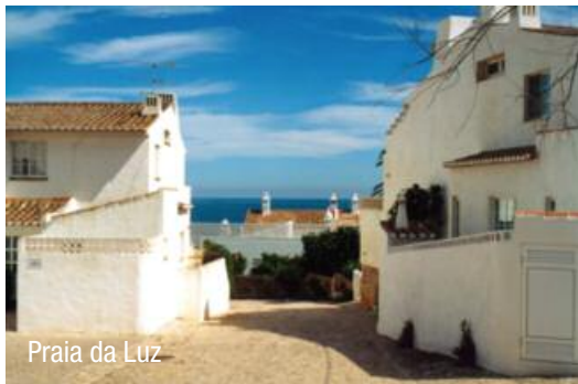
Praia da Luz