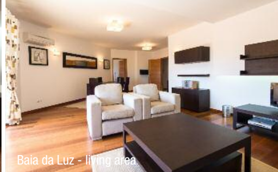
Baia da Luz - living area