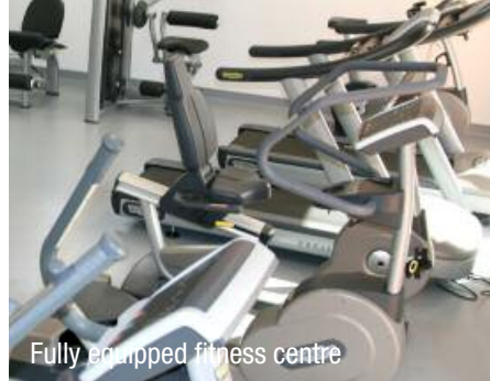
Fully equipped fitness centre