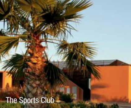
The Sports Club