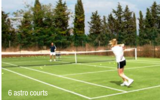
6 astro courts