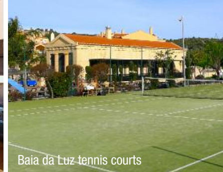
Baia da Luz tennis courts