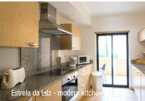
Estrela da Luz - modern kitchen