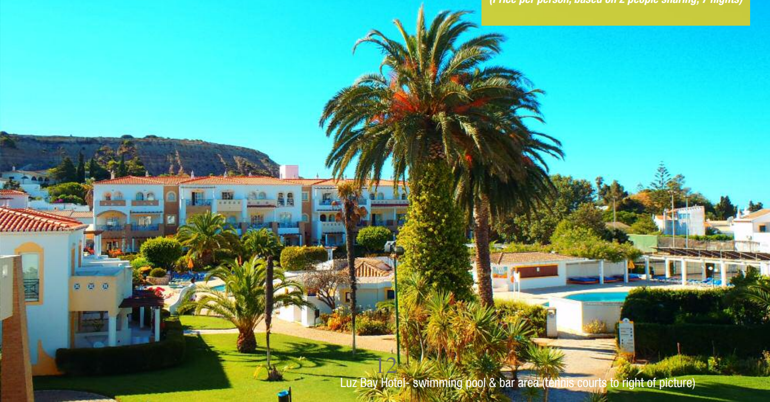
Luz Bay Hotel - swimming pool & bar area (tennis courts to right of picture)

(Price per person, based on 2 people sharing, 7 nights)