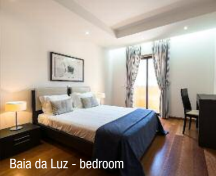
Baia da Luz - bedroom