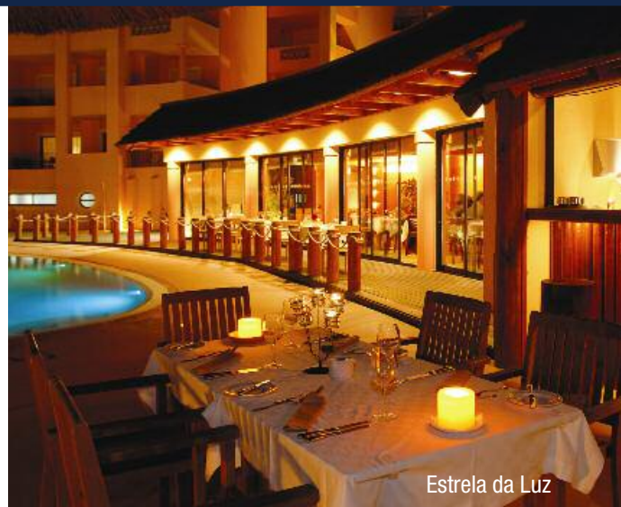
Estrela da Luz