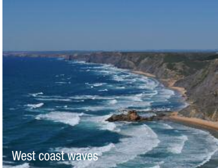
West coast waves