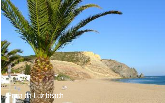
Praia da Luz beach