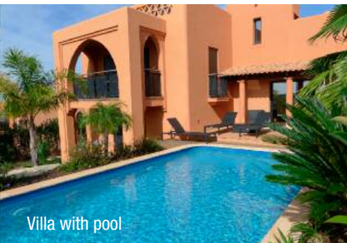
Villa with pool