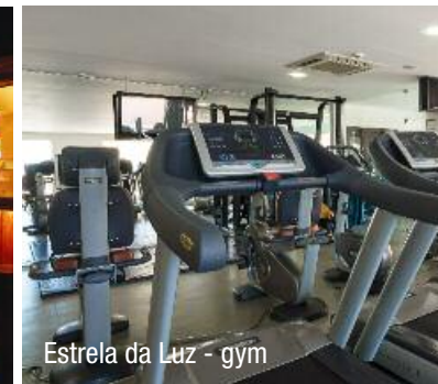
Estrela da Luz - gym