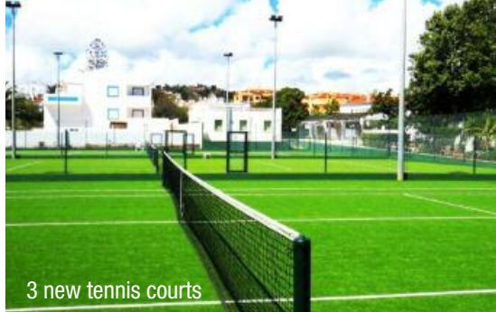
3 new tennis courts